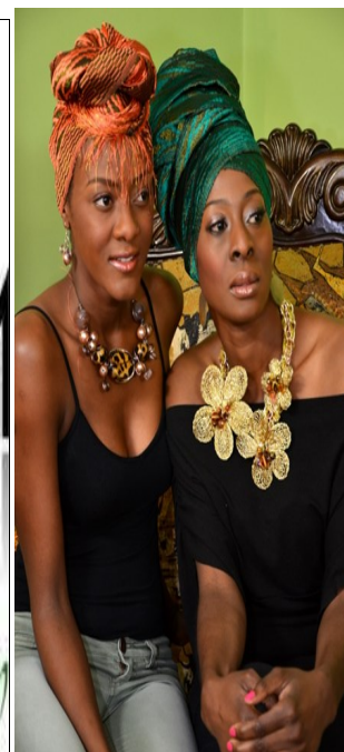
Models of Fahari Culture, Arts & Beauty